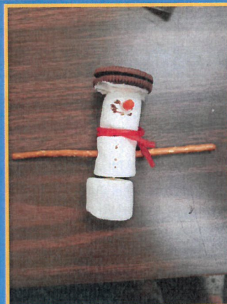
Snowman by Bella, Room 9

What is your favorite thing about winter?