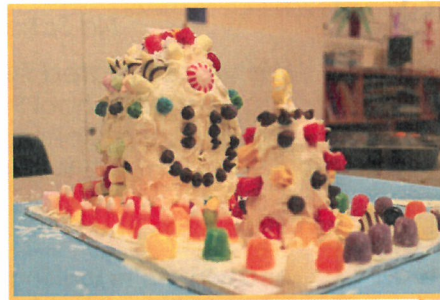
Room 9 made gingerbread houses with LOTS of candy!