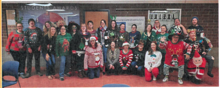
Staff celebrated with an Ugly Sweater Contest!