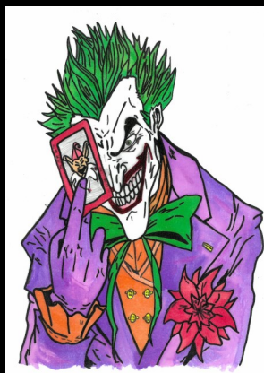
Title: The Winning Card Artists: Finn & Je Medium: Pen on paper