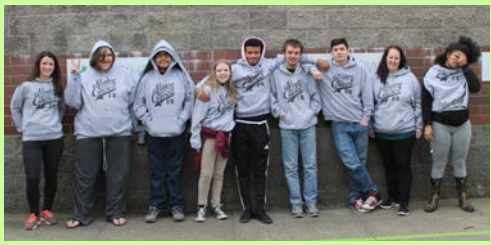
Student Council showing off their new duds!