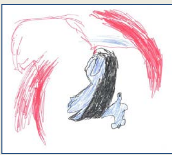
Artist: Lucy Title: "The Map of My World" Medium: Colored Pencil on Paper