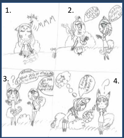
Artist: Chloe Title: Kitsune Medium: Pencil on Paper