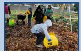
Room 8 working together in the garden